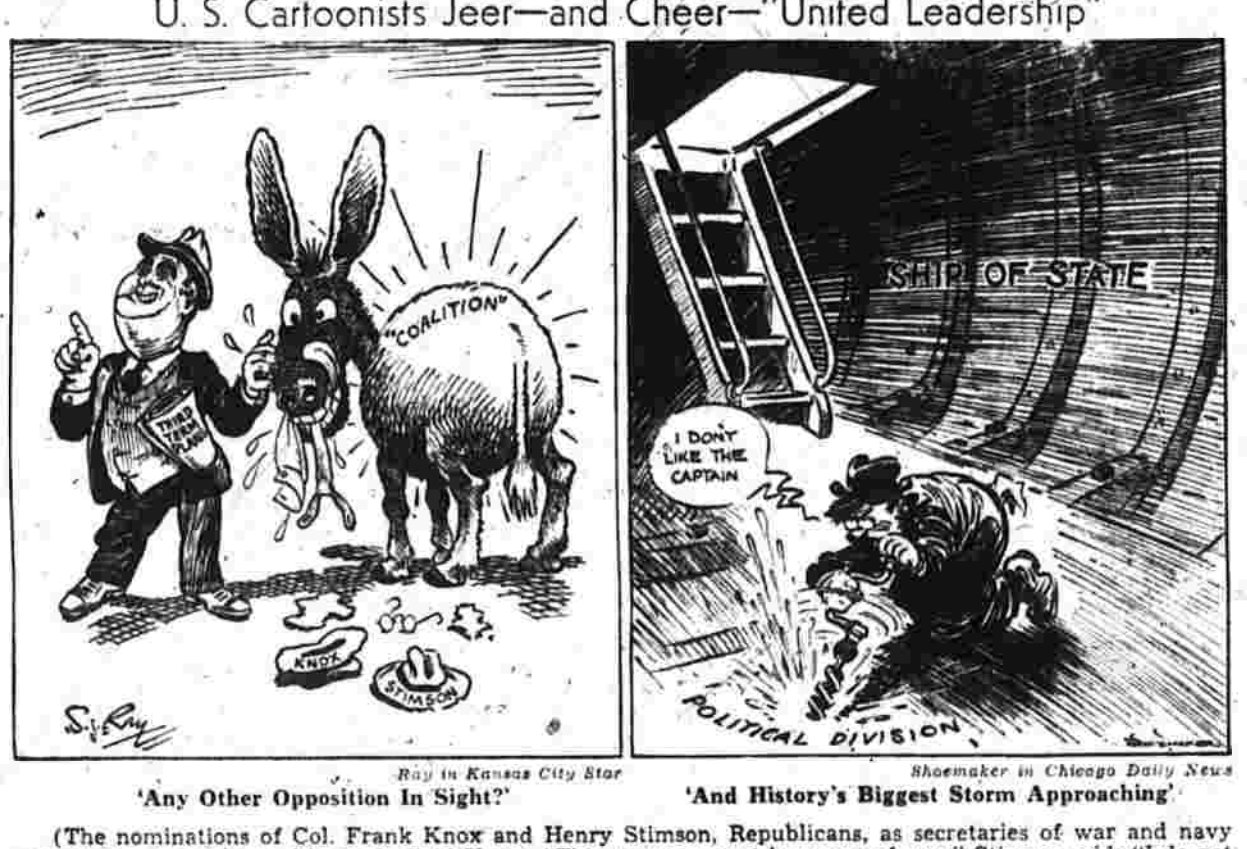
'And Others of Col. Frank Knox and Henry Stimson, Republicans, as secretaries of war and navy before the Senate this week. Said Knox: "This country must keep out of it."