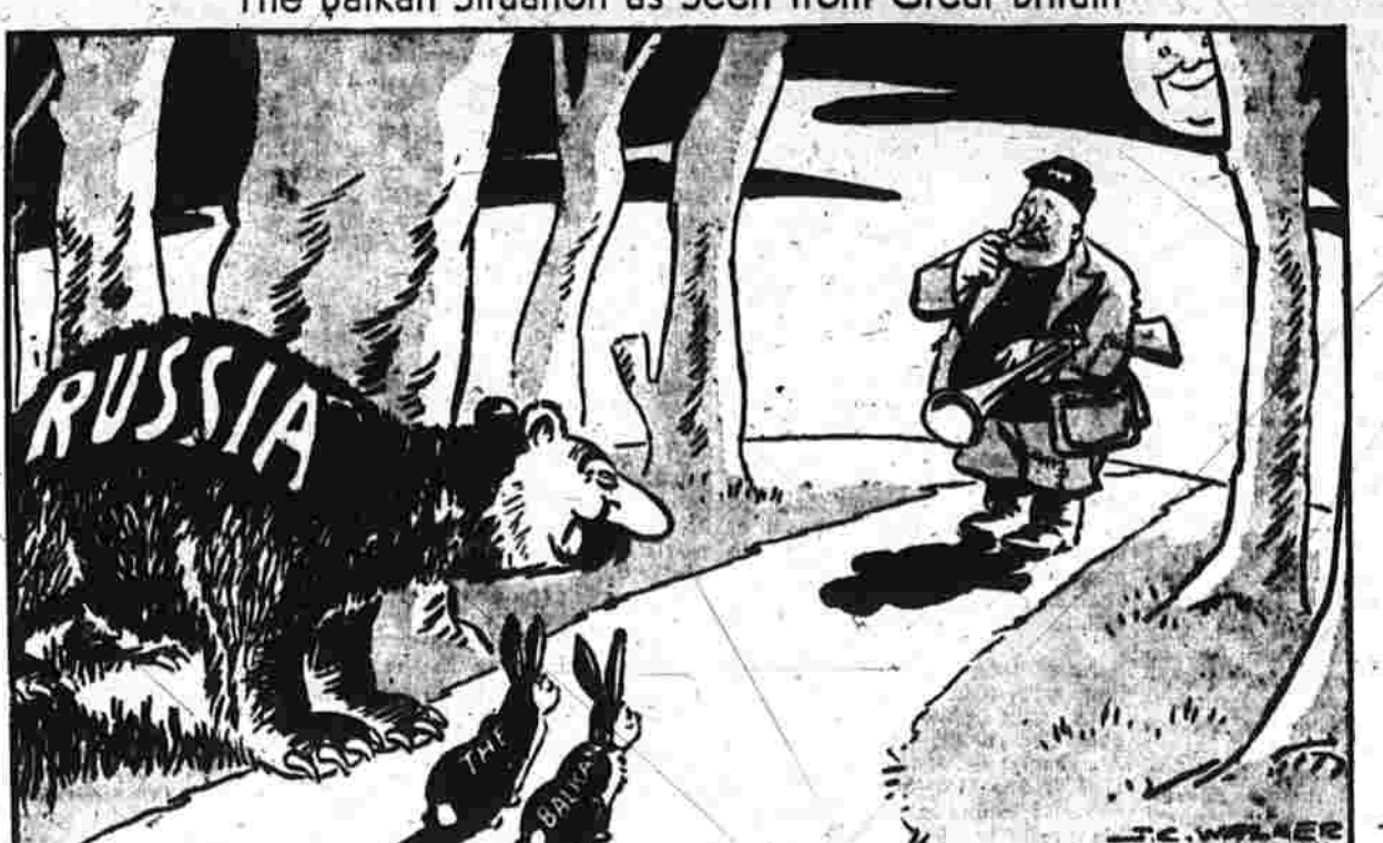
The Poacher: Hem, I Didn't Reckon On Big Game Being In The Vicinity